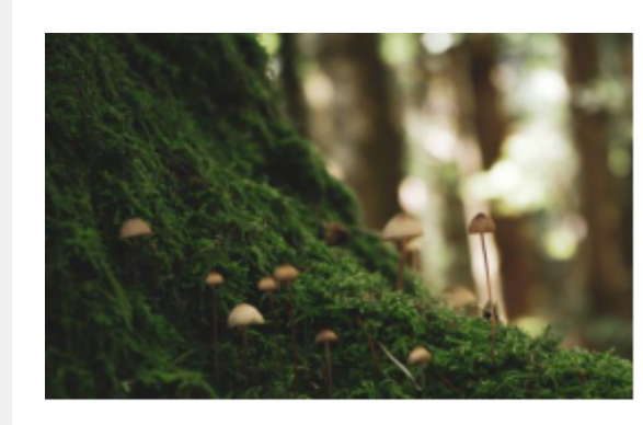
FQ at the Heart of It All Taking a Systems Perspective to Better Understand Your Family